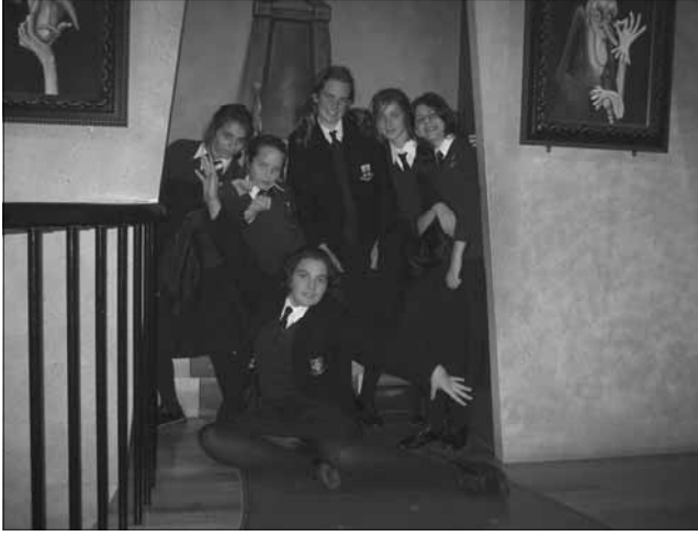
Years 7 & 8 at the Scienceworks Museum