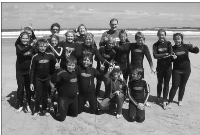
Another photo from the Year 7 Anglesea Camp — Surfies!